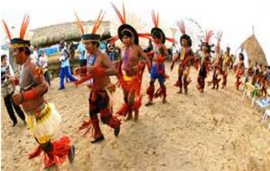
indigenous cultures around the world